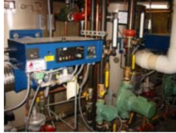
CHURCH (2) 1000MBH LES High Efficiency Condensing Boilers