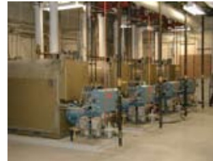
OFFICE BUILDING (4) 100 HP LES Boilers with Gordon Piatt Burners