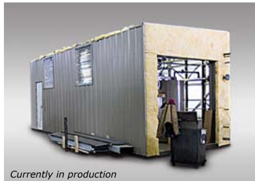
Currently in production

Fulton has excelled in the design and fabrication of customized skid system solutions for over 3 decades. Due to the demand for creative solutions to complex heat transfer applications, Fulton has become a single source manufacturer for custom pre-piped heat transfer equipment and accessories. These factory built systems insure that all components will be sized and installed correctly and will provide a quick and easy installation at the job site. Engineered Products Brochure