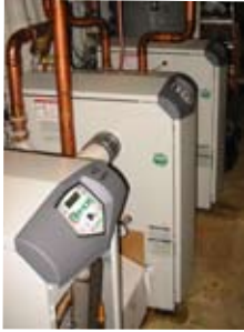
HOTEL (3) 500MBH Lochinvar Armor High Efficiency Condensing Domestic Water Heaters with (5) 200 Gallon Tanks

Ryan Company would be happy to take contractors or engineers to visit job sites where our equipment is installed. Weather you are interested in our boilers, water heaters, burners, chimneys or accessories, we will have a location to visit. Below are some examples.