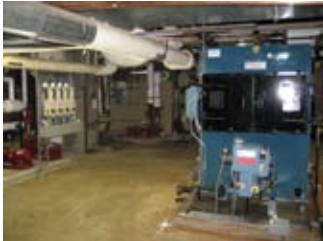
SPORTS FACILITY (1) 3000MBH Fulton Vantage, (2) 5650MBH Burnham Firebox Boilers with Gordan Piatt Burners