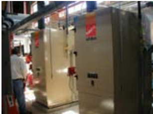
SCHOOL (2) 1400MBH Fulton Pulse High Efficiency Condensing Boilers