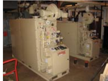
CHURCH (2) Fulton Vantage Combination Gas/Oil High Efficiency Condensing Boilers 1000MBH & 2000MBH